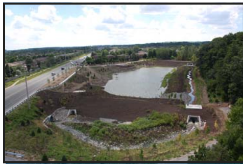
July 21, 2010

On Saturday, May 29, 2010 the Town of Richmond Hill was honoured by the Insurance Bureau of Canada (IBC) and Federation of Canadian Municipalities (FCM) with the 1st ever Watershed Award (Ontario Region). This award recognizes municipalities that have demonstrated leadership in their efforts to adapt to climate change by reducing their vulnerability to flooding and stormwater damage.